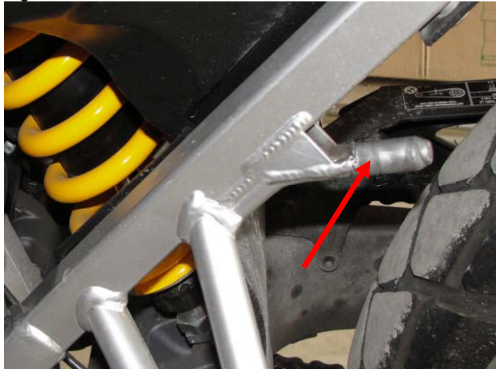
Fig4: Silencer rest stud

I tested this rack intensively in various conditions. While I am convinced it is a very good design, and it is stronger than it may look, I strongly recommend against putting more than 5Kg load on it, nor should anyone use it as a passenger seat. Safety also is something that comes with the riding style and weather conditions, so be careful and ride safe.